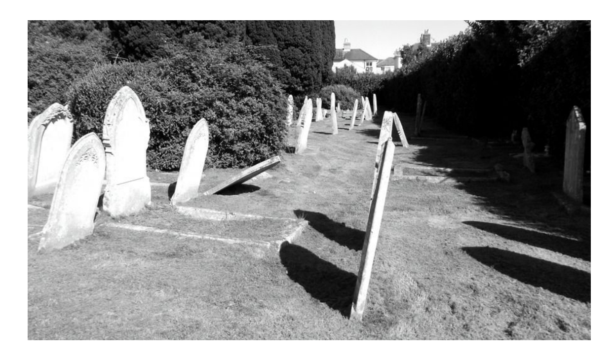
This picture gives a good indication of the inclination of a selection of headstones in the area suggested for this exercise

There is a selection of inclined memorials ranging from perfectly upright to leaning at approximately 50 degrees. None of them are unstable but the children should be warned not to push or lean on them.