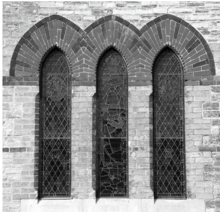
Windows on the East face of the Chapel

Two very obvious examples are shown below . . .