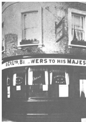
The Nag's Head

Here are just a few of the comments, stories and memories from people Ryde Social Heritage Group has helped.