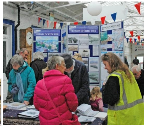
Exhibiting at Party on the Pier 31 March 2012