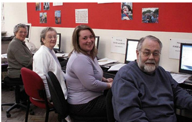
The volunteers adding records to the new website at the Ryde Development Trust Offices in Union Lane. 28 January 2006