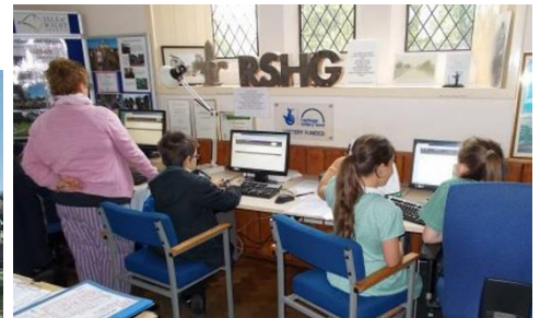
Greenmount Primary School using the RSHG computers in the North Chapel, 2016 [above]