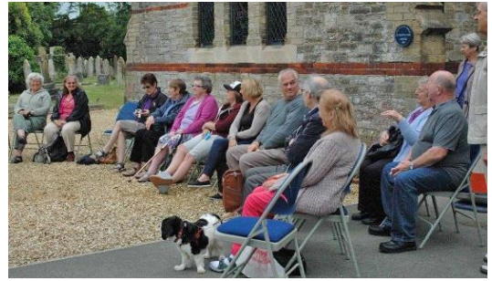
Waiting for the show to begin in the Cemetery

At a Havenstreet Country Women meeting 2018 [below]