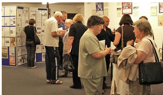
Celebrating the Book Launch in 2008